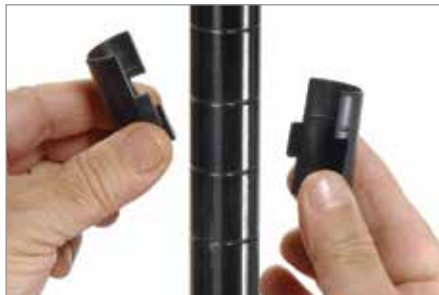
Simply snap together and slide shelf over clips for positive locking.