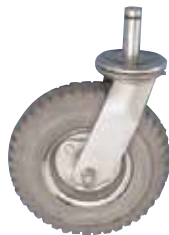
PNEUMATIC SWIVEL 2 1/2" x 8" 300 Lb. Capacity

Note: Load capacity ratings are per caster. All Stem casters include donut bumpers.