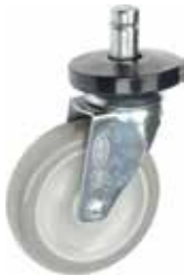
POLYURETHANE SWIVEL 1 1/4" x 5" 300 Lb. Capacity