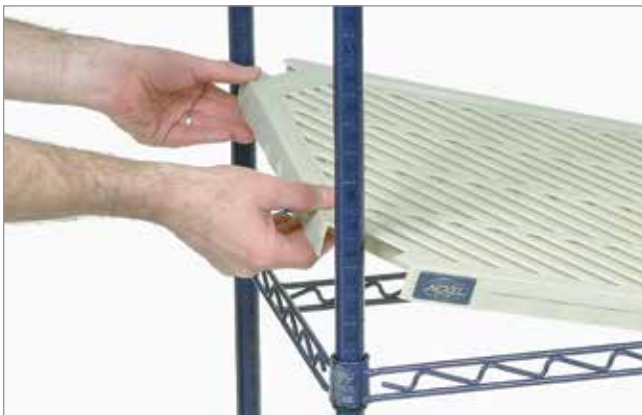
SHELF MATS CAN BE REMOVED EASILY FOR CLEANING